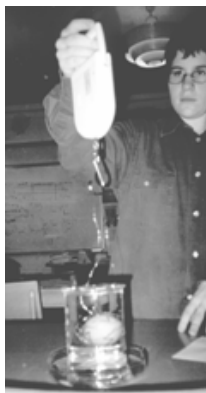
Fig. 4: Student determined the average density of a fresh egg.