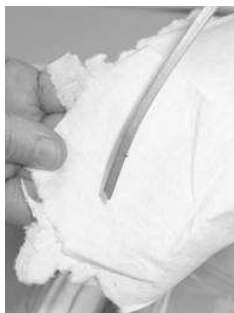
Fig. 7: Colored water ascending a flower stalk.