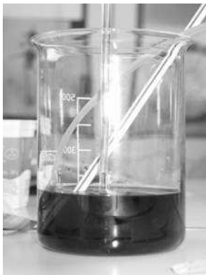
Fig. 6: Experiments with tubes of different diameters.

The physics and biology teachers proposed to a group of students to investigate and reproduce the model of flower stalks for explaining in which way the water reaches the leaves of plants starting from roots. The students cut longitudinally stalks observing inside capillaries. In a glass with blue-colored water they put stalks and tubes with different diameters (Fig. 6). In an easy way they concluded that h \sim 1/r where h is the height of water and r is the radius of the capillary / tube. In the flower stalk the colored water reached half the length of the stalk within a few minutes ( Fig. 7)