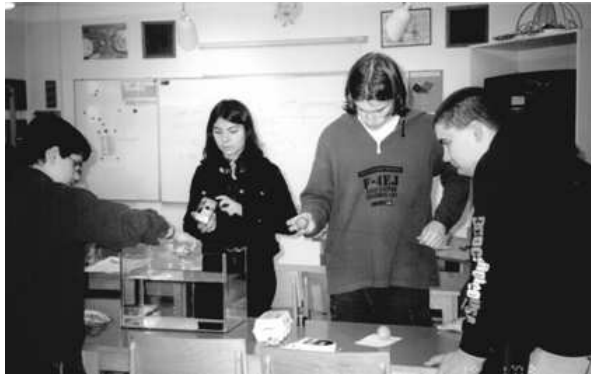
Fig. 2: A fresh egg, a one-week-old egg and a hard-boiled egg in water

They tried to construct a model of eggs floating in water ( Fig. 2, 3, 4 ).