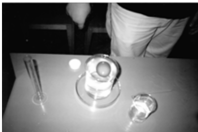
Fig. 3: A fresh egg, a one-week-old egg and a hard-boiled egg in a solution of water and sugar